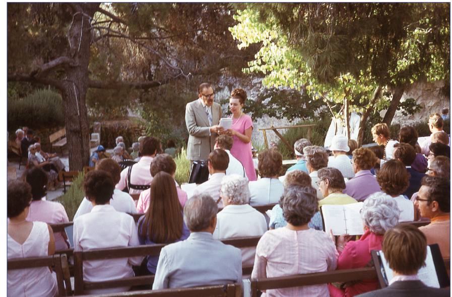
Communion Service at the Garden Tomb, Jerusalem, October 2, 1972